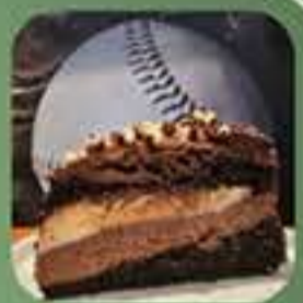
7 layer chocolate cheesecake

+ ask about our speciality cheesecake of the week!