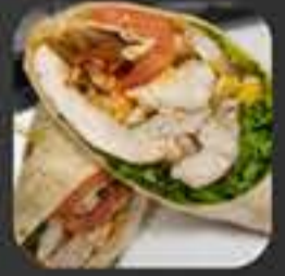
go pack wrap