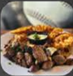
grand slam bites

LUNCH AND DINNER SERVED SUN. - THURS. 11AM-9PM | FRI. - SAT. 11AM-10PM