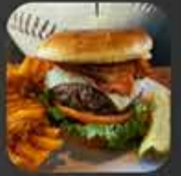
bacon time burger