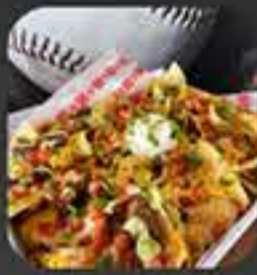
premium steak nachos

tenders tossed in your favorite sauce, paired with a side of your choice - try our new hot honey sauce!